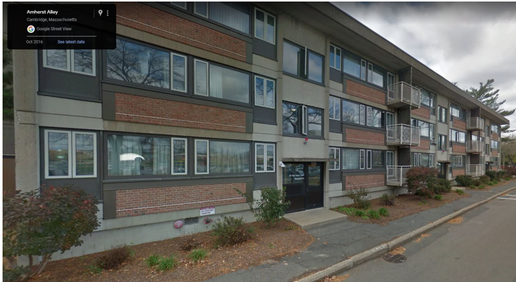
(Amherst Alley BEFORE)