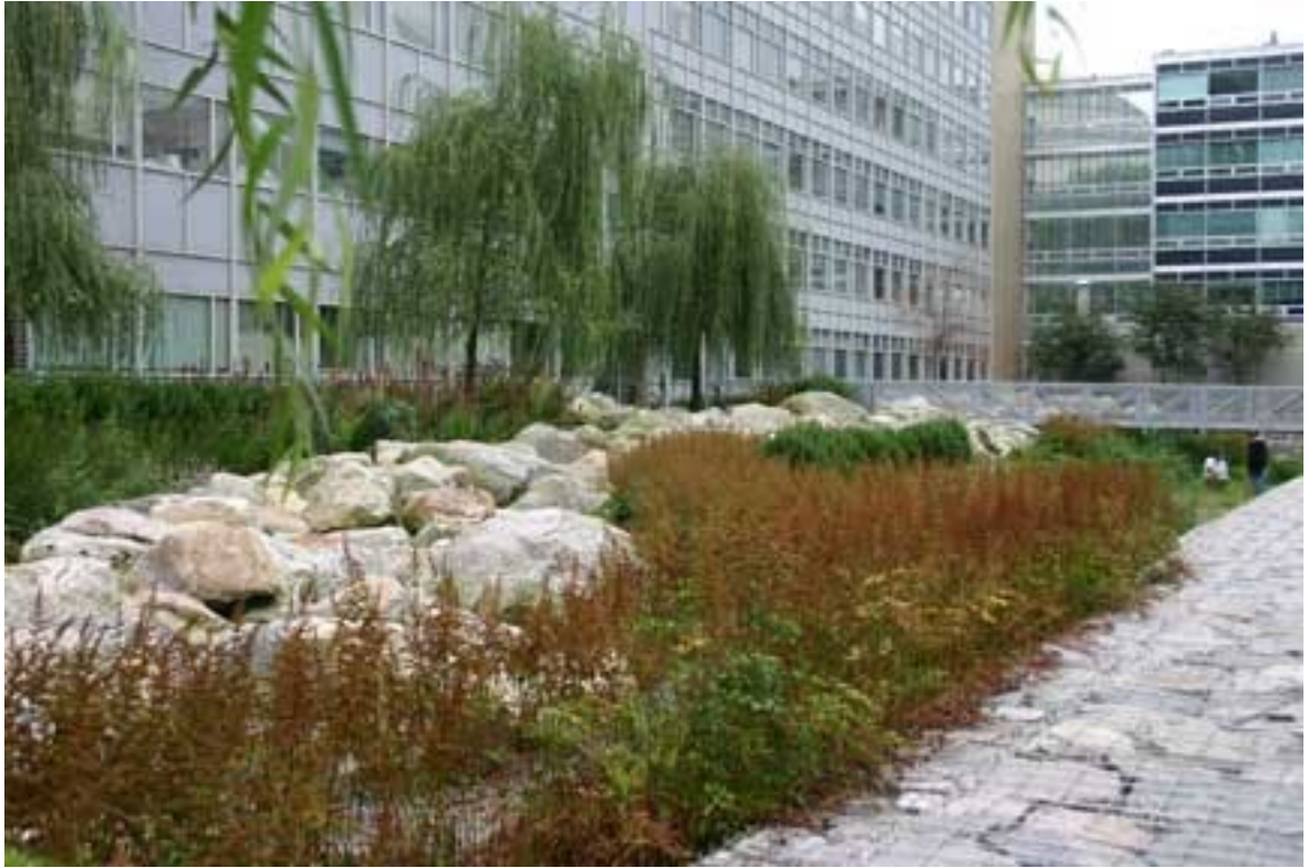
Stata Swale, 2008