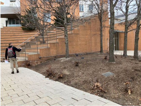
(Stata Center, 2023)